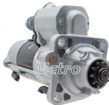
30692N Starter 12V, 4.8kw, CW, 10T Battery Post M12

For: Denso PLGR PA90 Replace: Application: Dim: Lester: OE: 428000-466 Ref: 190- Note: