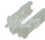
55-82009C Back Sheaver-Shift Lever

For: Denso PLGR PA90 Starters Used: 12V / 24V Replace: Dim: OE: 428000-3330, 428000-3331, 428000-512, 428000-586, 428000- 603, 428000-611, 428000-680, 428000-690, 428000-698, 428000- 709, 428000-710, 428000-712, 428000-714, 428000-787, 428000- 992 Lester: 10955, 16020, 19029, 19120, 19183, 19201, 19029, 19334, 19336, 19856, 16096, 33321 Note: Please use 55-82009, we don't sell Shift Lver only.