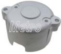
52-82503 CE Plate

For: Denso PLGR PA90 Starters Used: Replace: 128501-1350, 128501-1840 Dim: OE: 428000-603, 428000-680, 428000-709, 428000-710, 428000-934, 428000-991; 438000-006, 438000-311; 512800-0980 Lester: 10955, 16096, 19856, 33321 Note: Ref