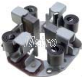
69-82510 Brush Holder Assy 24V, 7.8kw, CW

For: Denso PLGR PA90S Starters Used: Replace: 028510-6770 Dim: OE: 428000-5861, -5862, -5863 Lester: 19201 Note: May interchange with 69-82510