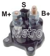
66-82671C Solenoid Cap Assy 12V, 3-Terminals

For: Denso PLGR PA90 Starters Used: Replace: Dim: OE: 428000-710 Lester: 33321 Note: