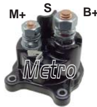
66-82678C Solenoid Cap Assy 12V, 3-Terminals

For: Denso PLGR PA90 Starters Used: Replace: Dim: Batt. Term M10 Motor Term M10 OE: 428000-3330, 428000-3331, 428000-593, 428000-611 Lester: 19029, 19183, 19201, 30691 Note: PIC Includes Cap, B+ & Motor Studs w/ Hardware, Gasket, & Contact