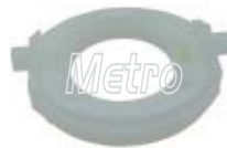
55-82009B Front Sheave-Shift Lever

For: Denso PLGR PA90 Starters Used: 12V / 24V Replace: 028740-5350 Dim: OE: 428000-3330, 428000-3331, 428000-512, 428000-586, 428000- 603, 428000-611, 428000-680, 428000-690, 428000-698, 428000- 709, 428000-710, 428000-712, 428000-714, 428000-787, 428000- 992 Lester: 10955, 16020, 19029, 19120, 19183, 19201, 19029, 19334, 19336, 19856, 16096, 33321 Note: Parts includes: 55-82009A Shift Lever 55-82009B Front Sheave 55-82009C Bach Sheave