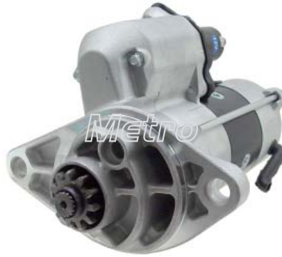
19201N Starter 12V, 3.0kw, CCW, 11T Battery Post M10

For: Dodge Ram, Sterling Replace: Application: Dodge Ram 2500, 3500 Dim: Lester: 19029, 19183 OE: 428000-3330, 428000-3331, 428000-6110 Ref: 190-799C, 190-799D, 190-799E Note: Can replace to 17548 (ND OSGR), 17892 (ND OSGR).