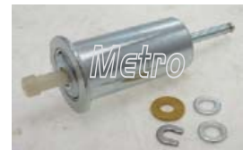
7966-82007K Plunger Kit

For: Denso PLGR PA90 Starters Used: Replace: Dim: Batt. Term M10 Motor Term M10 OE: 428000-5230 Lester: 19808 Note: PIC Includes Cap, B+ & Motor Studs w/ Hardware, Gasket, & Contact