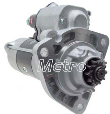
438000-3740 Starter 24V, 7.8kw, CW, 10T Battery Post M12

For: Denso PA90 Replace: Application: Caterpillar Hino: Lester: 30832 OE: 428000-7130, 428000-9950 Ref: Note: PIC 190-6347, 190-9221 428000-9950 same unit. DE Stud M