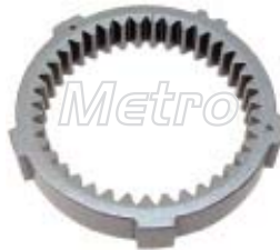
76-82524 Planetary Gear Track 39T

For: Denso PLGR PA90 Starters Used: Replace: 028630-5180 Dim: 8mm ID, 25.5mm OD, 12.5mm Thickness OE: 428000,333, 428000-512, 428000-586, 428000-603, 428000-611, 428000-680, 428000-690, 428000-698, 428000-709, 428000-710, 428000-712, 428000-714, 428000-787, 428000-992 Lester: 10955, 16096, 19029, 19120, 19201, 19334, 19336, 19856, 33321 Note: SZ-30116G This is for Lower Stationary Gear use.