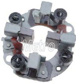
69-82509 Brush Holder Assy CW, 12V, 2.7kw/3.0kw

For: Denso PLGR PA90S Starters Used: Replace: 028510-6840 Dim: 79.1mm OD OE: 428000-3330, 428000-3331, 428000-512, 428000-531, 428000-586, 428000-603, 428000-611, 428000-680, 428000-698, 428000-709 Lester: 10955, 16096, 19029, 19120, 19183, 19201, 19335, 19336, 19856, Note: SZ-06116