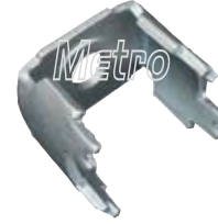
66-82564 Bracket-Solenoid Coil

For: Denso PLGR PA90 Starters Used: Replace: Dim: 14.7/23.9mm W x 45.8mm L x 3mm T OE: 428000-3330, 428000-3331, 428000-512, 428000-531, 428000-586, 428000-611 Lester: 19029, 19120, 19183, 19201, 19335 Note: Ref SZ-08116C used on Solenoid Cap for Motor Terminal.