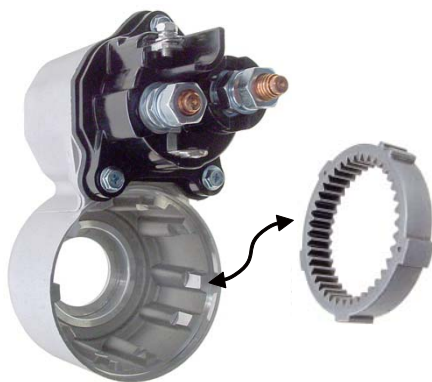
thinner Planetary Gear

To the Solenoid Housing, we found there is OE and after market type design, here is the different,