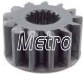
54-82554 Pinion Gear 13T, CW, 16-SPL

For: Denso PA90 Used: Replace: 028371-9050 Dim: 39.8mm Gear OD, 16.4mm ID 18mm Gear OD, 19.8mm OAL OE: 428000-512, 428000-523, 428000-531, 428000-698 Lester: 19120, 19335, 19336, 19808 Note: