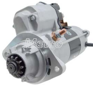
19808N Starter 12V, 3.0kw, CW, 11T Battery Post M10

For: D Replace: Application: Dim: Lester: 33334 OE: 428000-4610, 428000-4611, 428000-4612 Ref: 190-6435 Note: