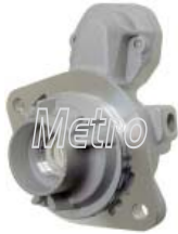
51-826002 DE Housing

For: Denso PLGR PA90 Starters Used: Replace: Dim: OE: 428000-603, 428000-991 Lester: 19856 Note: Ref 190-6318, 190-6318A