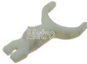
55-82009A Shift Lever

For: Denso PLGR PA90 Starters Used: 12V / 24V Replace: Dim: OE: Lester: Note: Ref SZ-13116K Parts Includes: 55-82009A Shift Lever 55-82009B Front Sheave 55-82009C Back Sheave 54-82859 Spacer (35.8mmODx20.4mmIDx1.5mmT) 54-82860 Spacer (28mmODx20.45mmIDx1mmT)