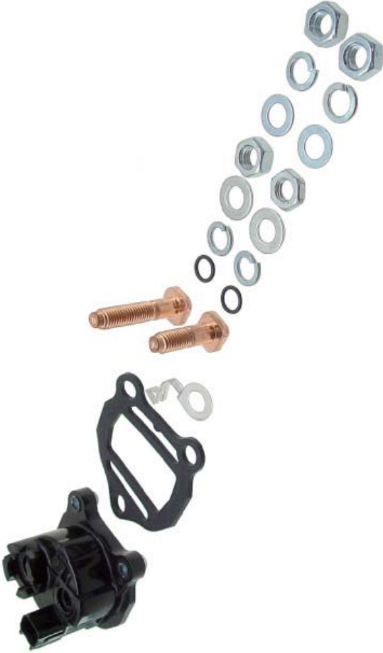
Solenoid Cap Assembly