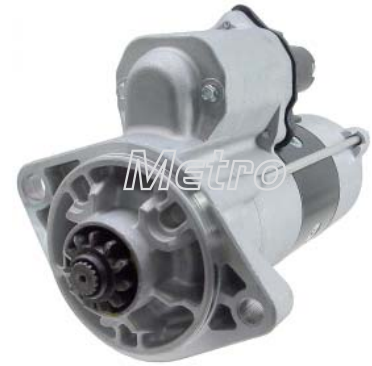
19336N Starter 12V, 3.0kw, CW, 11T Battery Post M10

For: Isuzu, Chevy-GMC Truck Replace: Car: 2008 Isuzu NPR, NQR & NRR Applications with 5.2L Engines Dim: Lester: 19201 OE: 428000-586 Ref: 190-9073 Note: Can replace to 18500 (Denso OSGR, CCW).