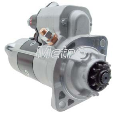
16020N Starter 24V, 7.8kw, CW, 10T Battery Post M12

For: Denso PA90L Replace: Car: Various use w/Cummins ISF 2.8L, 3.8L, QSB 5.9L, 6.7L Engines. Cummins: 4996706 Lester: 16096 OE: 428000-709 Ref: 190-6307 Note: Also can replace to Delco 35MT 8200959 DE Stud M