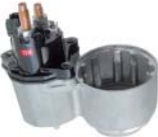
Solenoid Assy with Lever Housing