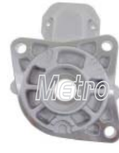
51-826007 DE Housing 12V, 3.0kw

For: Denso PLGR PA90 Starters Used: Replace: 428400-6900 Dim: OE: 428000-574, 428000-690, 428000-992 Lester: 16014, 30692 Note: 16014, 30692 Ref 190-6313, 190-6387, 190-9244 wo/Ground Stud Hole.