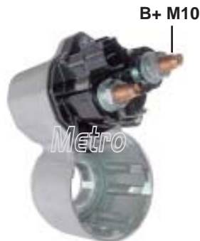
66-82671 Solenoid Assy 12V, 3.0kw, 3-Terminals

For: Denso PLGR PA90 Starters Used: Replace: 153400-9262 Dim: Batt. Term M10 x 1.50 Motor Term M10 x 1.50 Switch Term Spade OE: 428000-3330, 428000-3331, 428000-611 Lester: 19029, 19183 Note: Use w/Lower Stationary Gear