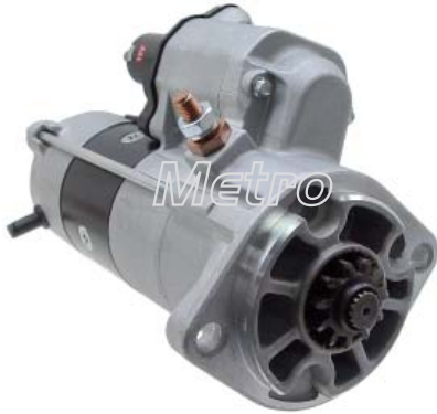
10955N Starter 12V, 2.7kw, CW, 11T Battery Post M10

For: Denso PA90S Replace: Application: JLG Equipment w/Cummins QSB 3.3L Cummins: 5256155 Lester: 10955 OE: 428000-6800 Ref: 190-6470 Note: DE Stud M10