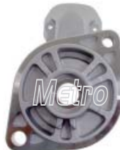
51-826006 DE Housing V, kw

For: Denso PLGR PA90 Starters Used: Replace: 428400-7870 Dim: OE: 428000-714, 428000-715, 428000-787 Lester: 19334 Note: Ref 190-169, 190-6354, 190-6357