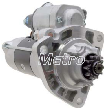
428000-7150N Starter 12V, 4.8kw, CW, 11T Battery Post M

For: Denso PA9 Replace: Application: Caterpillar Hino: Lester: 30832 OE: 428000-7130, 428000-9950 Ref: PIC 190-6347, 190-9221 Note: 428000-7130 same unit, please use 428000-7130 DE Stud M