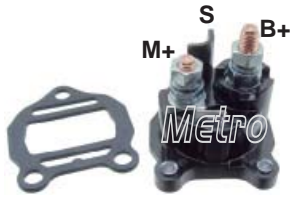
66-82668C Solenoid Cap Assy 12V, 3-Terminals

For: Denso PLGR PA90 Starters Used: Replace: Dim: Batt. Term M10 Motor Term M10 OE: 428000-512 Lester: 19120 Note: PIC Includes Cap, B+ & Motor Studs w/ Hardware, Gasket, & Contact