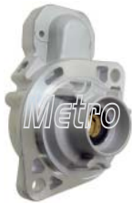
51-826013 DE Housing 12V, 2.7kw

For: Denso PLGR PA90 Starters Used: Replace: Dim: OE: 428000-461 Lester: 33334 Note: 190-6335