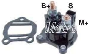
66-82669C Solenoid Cap Assy 12V, 3-Terminals

For: Denso PLGR PA90 Starters Used: Replace: Dim: OE: 428000-3330, 428000-3331, 428000-611 Lester: 19029, 19183 Note: used with 66-82669C. SZ-09116G