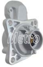
51-826001 DE Housing 12V, 2.7kw

For: Denso PLGR PA90 Starters Used: Replace: 428400-3331 Dim: OE: 428000-333, 428000-611 Lester: 19029, 19183 Note: Ref SZ-03116, 190-799C, 190-799D (with or without Seal & Bushing)