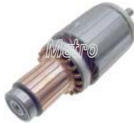
61-82508 Armature 24V, 7.8kw, CW

For: Denso PLGR PA90L Starters Used: Replace: Dim: 19 Bars, 9T Straight Spline 34.40mm Commutator OD 38.5mm Commutator Length 10mm DE Shaft, 10mm CE Shaft 59mm OD 178mm OAL OE: 428000-5740, 428080-5740, 428000-711, 428000-734, 428000- 994 Lester: 30483 Note: with both side Bearing