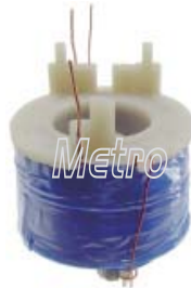
66-82210 Coil - Solenoid 24V, kw

For: Denso PLGR PA90 Starters Used: Replace: Dim: OE: Lester: Note: