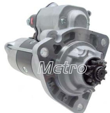
428000-7140N Starter 24V, 7.8kw, CW, 10T Battery Post M12

For: Denso PA90S Replace: Car: Various w/Cummins ISB 6.7L Engines. Cummins: 4996707 Lester: 33321, 33335 OE: 428000-7100, 438000-0060 Ref: 190-002, 190-9251 Note: DE Stud