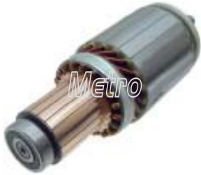
61-82506 Armature 12V, 4.8kw, CW

For: Denso PLGR PA90L Starters Used: Replace: Dim: 19 Bars, 9T Straight Spline 34.40mm Commutator OD 38.5mm Commutator Length 10mm DE Shaft, 10mm CE Shaft 59mm OD 178mm OAL OE: 428000-5740, 428080-5740, 428000-711, 428000-734, 428000- 994 Lester: 30483 Note: with both side Bearing