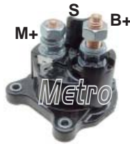
66-82673C Solenoid Cap Assy 12V, 3-Terminals

For: Denso PLGR PA90 Starters Used: Replace: Dim: Batt. Term M10 Motor Term M10 OE: 428000-512 Lester: 19120 Note: PIC Includes Cap, B+ & Motor Studs w/ Hardware, Gasket, & Contact