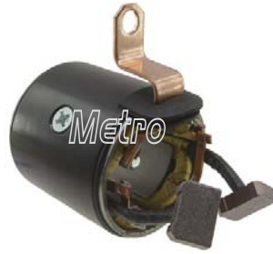
57-8258 Field Case Assy 24V, CW, 4.8kw, 7.8kw

For: Denso PLGR PA90S Starters Used: Replace: 128100-0211 Dim: OE: 428000-710, 438000-006 Lester: 33321 Note: Lip for O-Ring 85mm OD