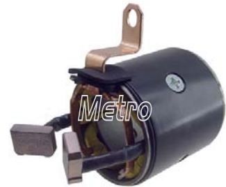
57-8261 Field Case Assy 12V, 4.8kw, CW

For: Denso PLGR PA90 Starters Used: Replace: 128100-0190 Dim: OE: 428000-698, 428000-715, 428000-787, 428000-996 Lester: 19334, 19336 Note: Lip for O-Ring 85mm OD