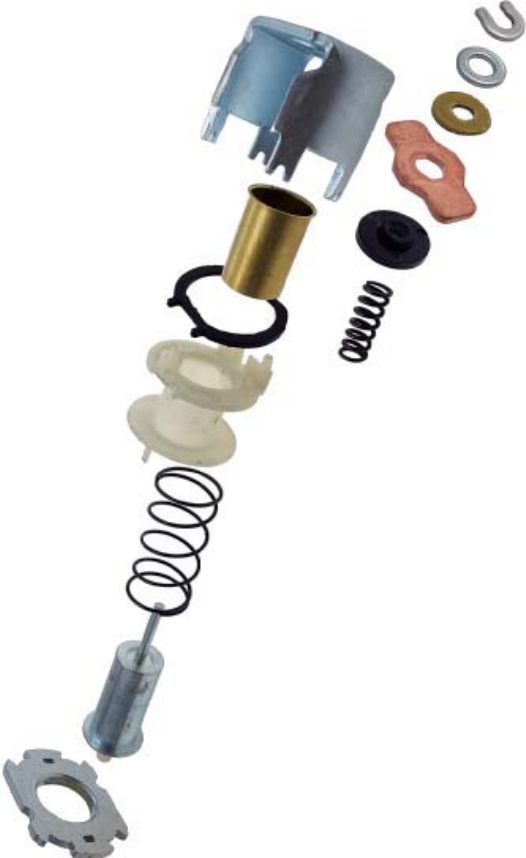
Solenoid Exploded View