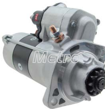
33321N Starter 24V, 4.8kw, CW, 10T Battery Post M10

For: Denso PLGR PA90 Replace: Application: John Deere w/4045 4.5L, 6068/6.8L, 6090 9.0L Engines John Deere: RE537519, RE538685, RE549230, SE502559, SE502823 Lester: 16014 OE: 428000-6900, 428000-9920 Ref: 190-6313, 190-6313A, 190-6313B Note: DE Stud M 428000-9920 same unit.