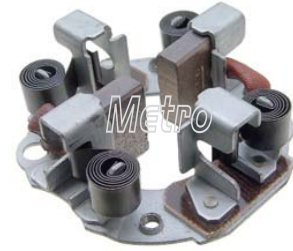
69-82516 Brush Holder Assy 12V, CCW, 3.0kw

For: Denso PLGR PA90S Starters Used: Replace: 028510-6830 Dim: OE: 428000-690, 428000-7140, 428000-9920 Lester: 16014, 30419 Note: May interchange with 69-82510