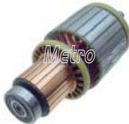
61-82509 Armature 24V, CW, 4.8kw

For: Denso PLGR PA90S Starters Used: Replace: 028200-8650 Dim: 23 Bars, 9T Straight Spline 60.2mm OD, 156.5mm OAL DE OD 10mm, CE OD 10mm OE: 428000-3330, 428000- 3331, 428000-5120, 428000- 5230, 428000-5310, 428000- 5311, 428000-5312, 428000- 5860, 428000-5861, 428000- 5862, 428000-5863, 428000- 603, 428000-6110, 428000-680, 428000-698, 428000-709, 428080- 586, 428000-934, 428000-991, 438000-311 Lester: 10955, 16096, 19029, 19120, 19183, 19201, 19335, 19336, 19808, 19856 Note: SZ 01116 with both side Bearing