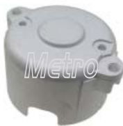
52-82506 CE Plate

For: Denso PLGR PA90 Starters Used: Replace: 128501-0470 Dim: 89.5mm OD, 65mm Height Drain hole 5.6mm ID, 2.7mm Wall Thickness OE: 428000-333, 428000-523, 428000-531, 428000-611 Lester: 19029, 19183, 19335, 19808 Note: Ref SZ-04116