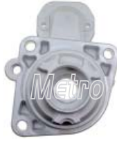
51-826004 DE Housing 12V, 4.8kw, 7.8kw

For: Denso PLGR PA90 Starters Used: Replace: 428400-3331 Dim: OE: 428000-333, 428000-611 Lester: 19029, 19183 Note: Ref SZ-03116, 190-799C, 190-799D (with or without Seal & Bushing)