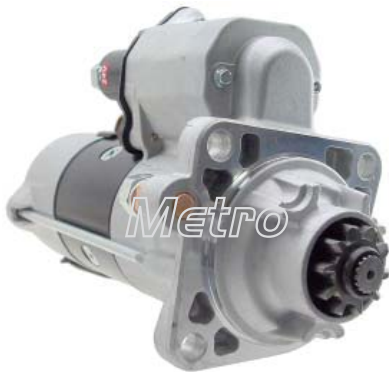
16014N Starter 24V, 7.8kw, CW, 10T Battery Post M12

For: Denso PA90L Replace: Car: Ingersoll Rand XP825-W w/Cummins 6CTA 8.3L Engines. Cummins: 4996709 Lester: 16020 OE: 428000-7120,438000-3730 Ref: 190-6346 Note: Unit same as 438000-3730. DE Stud M