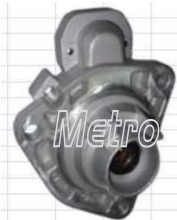
51-826003 DE Housing 12V, 4.8kw

For: Denso PLGR PA90 Starters Used: Replace: Dim: OE: 428000-698 Lester: 19336 Note: Ref 190-6308