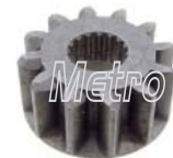
54-82557 Pinion Gear 12T, CW, 16-SPL

For: Denso PA90 Used: Replace: Dim: 39.8mm Gear OD OE: Lester: 19201 Note: Clutch Assemble use 54-82030