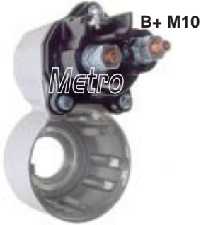
66-82668 Solenoid Assy 12V, 3-Terminals

For: Denso PLGR PA90 Starters Used: Replace: 153400-9931 Dim: Batt. Term M10 x 1.50 Motor Term M10 x 1.50 Switch Term M5 x 0.8 OE: 428000-512 Lester: 19120 Note: Cap Assy use 66-82668C Use w/Lower Stationary Gear