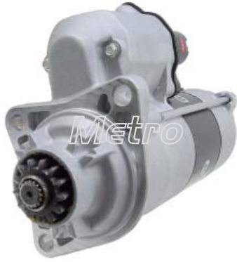
19029N Starter 12V, 3.0kw, CW, 13T Battery Post M10

For: Dodge Ram, Sterling Replace: Application: Dodge Ram 2500, 3500 Dim: Lester: 19029, 19183 OE: 428000-3330, 428000-3331, 428000-6110 Ref: 190-799C, 190-799D, 190-799E Note: Can replace to 17548 (ND OSGR), 17892 (ND OSGR).