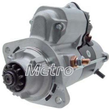
19120N Starter 12V, 2.7kw, CW, 11T Battery Post M10

For: Hino HD Truck Replace: Car: Hino HD Trucks 2009-2013 Dim: Lester: 19336 OE: 428000-6980, 428080-6981 Ref: 190-6308 Note: