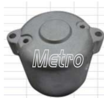
52-82508 CE Plate

For: Denso PLGR PA90 Starters Used: Replace: 128501-1820 Dim: OE: 428000-787 Lester: 19334 Note: Ref