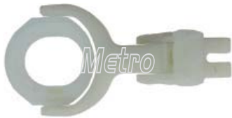
55-82009 Shift Lever

For: Denso PLGR PA90 Starters Used: 12V / 24V Replace: Dim: OE: 428000-3330, 428000-3331, 428000-512, 428000-586, 428000- 603, 428000-611, 428000-680, 428000-690, 428000-698, 428000- 709, 428000-710, 428000-712, 428000-714, 428000-787, 428000- 992 Lester: 10955, 16020, 19029, 19120, 19183, 19201, 19029, 19334, 19336, 19856, 16096, 33321 Note: Please use 55-82009, we don't sell Shift Lver only.