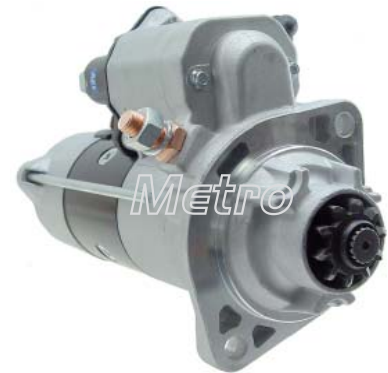
30483N Starter 12V, 4.8kw, CW, 10T Battery Post M10

For: Thomas Built Replace: Car: Thomas Bus Applications with Cummins ISB Engines Dim: Lester: 19335 OE: 428000-5230, 428000-5310 Ref: 190-9062 Note: 428000-5230 (19808) same unit.