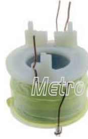
66-82209 Coil-Solenoid 12V, kw

For: Denso PLGR PA90 Starters Used: Replace: Dim: 6.4mm ID x 12mm OD x 1.5mm Thickness OE: Lester: Note: