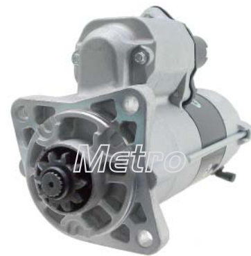
19856N Starter 12V, 3.0kw, CW, 10T Battery Post M10

For: Denso PA90L Replace: Car: John Deere w/4045 4.5L, 6068 6.8L, 6090, 90L Engines. Dim: John Deere: RE539696, RE549229 Lester: 30692 OE: 428000-5740, 428000-5741 Ref: 190-6387 Note: DE Stud M12