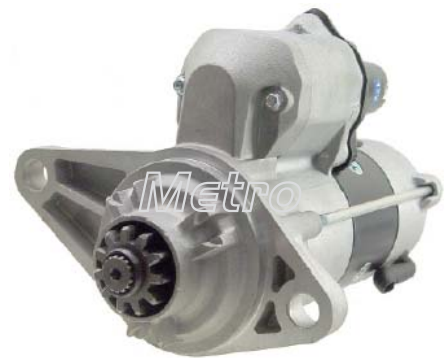
30691N Starter 12V, 3.0kw, CCW, 11T Battery Post M10

For: Denso PA90S Replace: Car: Freightliner Custom Chassis, Work-horse w/Cummins ISB 6.7L Engine Dim: Lester: 19808 OE: 428000-523, 428000-5310 Ref: 190-9061 Note: DE Stud M 428000-5310 (19335) same unit.