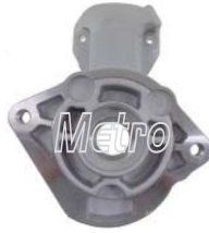
51-826015 DE Housing V, kw

For: Denso PLGR PA90 Starters Used: JLG Equipment Replace: Dim: OE: 428000-680 Lester: 10955 Note: 190-6470 DE w/Ground Stud Hole M12 x 1.75