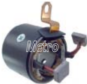
57-8257 Field Case Assy 12V, CW

For: Denso PLGR PA90S Starters Used: Replace: Dim: OE: 428000-586, 428080-586, 428000-593 Lester: 19201 Note: This is CCW Field Case Assy