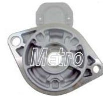
51-826008 DE Housing 12V, 3.0kw

For: Denso PLGR PA90 Starters Used: Replace: Dim: OE: 428000-586, 428000-593 Lester: 19201 Note: Ref 190-9073, 190-9074 Used on CCW unit.