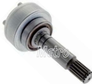
54-82031 Clutch Assy CW

For: Denso PA90 Starters Used: Replace: Dim: OE: 428000-586, 428000-593, 428080-586 Lester: 19201 Note: Clutch assemble with Sleeve & Bearing.