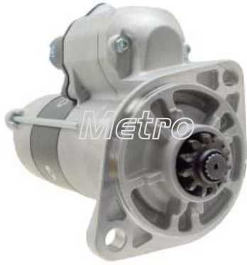
428000-4620N Starter 12V, 3.0kw, CW, 11T Battery Post M

For: Denso PA90S Replace: Application: Hino 300/Toyota Coaster Mid Bus Hino: Lester: OE: 428000-4620 Ref: Note: