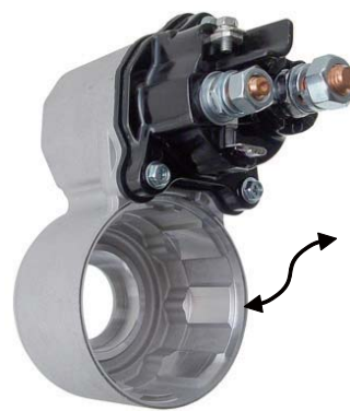
thicker Planetary Gear