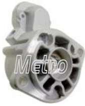
51-826011 DE Housing 12V, 2.7kw

For: Denso PLGR PA90 Starters Used: JLG Equipment Replace: Dim: OE: 428000-680 Lester: 10955 Note: 190-6470 DE w/Ground Stud Hole M12 x 1.75