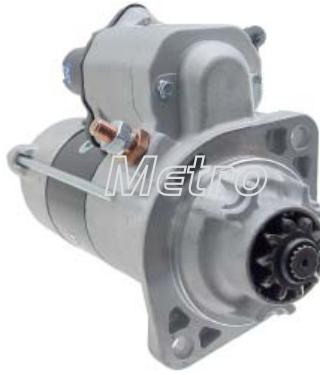
16096N Starter 12V, 2.7kw, CW, 10T Battery Post

For: Denso PA90S Replace: Application: JLG Equipment w/Cummins QSB 3.3L Cummins: 5256155 Lester: 10955 OE: 428000-6800 Ref: 190-6470 Note: DE Stud M10