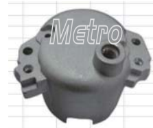
52-82511 CE Plate

For: Denso PLGR PA90 Starters Used: Replace: 128501-1780 Dim: OE: 428000-711, 428000-712, 428000-994; 438000-373 Lester: 16020, 30483, 30693 Note: Ref 190-6344, 190-6346, 190-9220, 190-9257