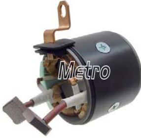
57-8255 Field Case Assy 24V, CW, 4.8kw

For: Denso PLGR PA90S Starters Used: Replace: 128100-0211 Dim: OE: 428000-710, 438000-006 Lester: 33321 Note: Lip for O-Ring 85mm OD