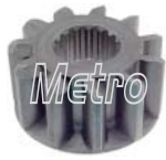
54-82553 Pinion Gear 11T, CW, 16-SPL

For: Denso PA90 Used: Replace: 028371-9050 Dim: 39.8mm Gear OD, 16.4mm ID 18mm Gear OD, 19.8mm OAL OE: 428000-512, 428000-523, 428000-531, 428000-698 Lester: 19120, 19335, 19336, 19808 Note: