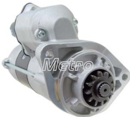
428000-4661N Starter 12V, 3.0kw, CW, 11T Battery Post

For: Denso PA90S Replace: Car: Isuzu, Chevrolet, GMC Truck 2008 up w/MT Isuzu 4HK1-TC 5.2L GM: 98092464 Isuzu: 8980924640, 8980924641, 428980924642 Lester: 30691 OE: 428000-5930, 428000-5931, 428000-5932 Ref: 190-9074 Note: Can replace to Denso 18407 OSGR, but dependon the location.