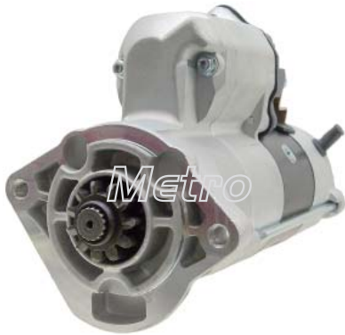
33334N Starter 12V, 3.0kw, CW, 11T Battery Post

For: D Replace: Application: Dim: Lester: 33334 OE: 428000-4610, 428000-4611, 428000-4612 Ref: 190-6435 Note: