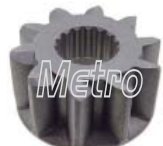
54-82555 Pinion Gear 10T, CW, 16-SPL

For: Denso PA90 Used: Replace: 028371-8810 Dim: 39.8mm Gear OD, 16.65mm ID 19.8mm OAL OE: 428000-3330, 428000-3331, 428000-6110, 428000-8400, 428000-8760 Lester: 19029, 19183 Note: SZ-07116A