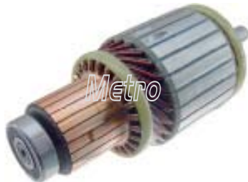
61-82507 Armature 12V, 3.0kw, CW

For: Denso PLGR PA90L Starters Used: Replace: 028200-9070 Dim: OE: 428000-698, 428000-787 Lester: 19334, 19336 Note: