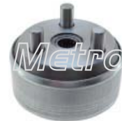
76-82526 Planetary Drive

For: Denso PLGR PA90 Starters Used: Replace: 90557-20000 Dim: 22.8mm OD, 18.7mm ID, 1.2mm Thickness OE: 428000,333, 428000-586, 428000-603, 428000-611, 428000-680, 428000-690, 428000-698, 428000-709, 428000-710, 428000-712, 428000-714, 428000-787, 428000-992 Lester: 10955, 16020, 16096, 19029, 19201, 19336, 19856, 33321 Note: