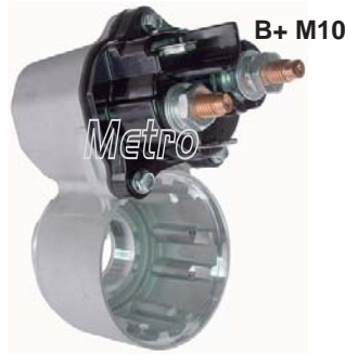
66-82670 Solenoid Assy 24V, 3-Terminals

For: Denso PLGR PA90 Starters Used: Replace: 153400-9931 Dim: Batt. Term M10 x 1.50 Motor Term M10 x 1.50 Switch Term M5 x 0.8 OE: 428000-512 Lester: 19120 Note: Cap Assy use 66-82668C Use w/Lower Stationary Gear