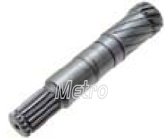
54-82857 Shaft-Drive CW, 12-SPL

For: Denso PA90 Used: Isuzu Truck Replace: Dim: 40.3mm Gear OD, 17mm Gear Length, 21.35mm W OE: 428000-5930, -5931, -5932 Lester: 30691 Note: