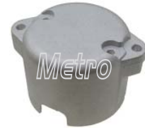
52-82510 CE Plate 24V, 7.8kw

For: Denso PLGR PA90 Starters Used: Replace: 128501-1670 Dim: OE: 428000-574, 428080-574, 428000-690, 428000-714, 428000-734, 438000-374, 428000-992 Lester: Note: Ref