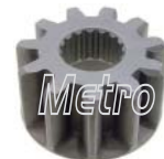
54-82558 Pinion Gear 11T, CCW, 16-SPL

For: Denso PA90 Used: Replace: Dim: 44.9mm Gear OD, 16mm Gear OE: Length, 19.8mm W Lester: Note: