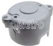
52-82505 CE Plate

For: Denso PLGR PA90 Starters Used: Replace: 128501-1350, 128501-1840 Dim: OE: 428000-603, 428000-680, 428000-709, 428000-710, 428000-934, 428000-991; 438000-006, 438000-311; 512800-0980 Lester: 10955, 16096, 19856, 33321 Note: Ref