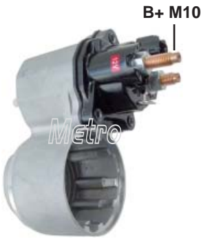
66-82669 Solenoid Assy 12V, 2.7kw, 3-Terminals

For: Denso PLGR PA90 Starters Used: Replace: 253400-1170 Dim: Batt. Term M10 x 1.50 Motor Term M10 x 1.50 Switch Term OE: 428000-461, 428000-710, 438000-006 Lester: 33321, 33334 Note: Use w/Lower Stationary Gear