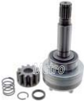
54-8533 Drive Assy 11T, CCW

For: Denso PLGR PA90 Starters Used: Replace: Dim: OE: 428000-586, 428000-593, 428080-586 Lester: 19201 Note: CCW Drive Gear use 54-82558