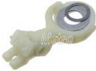
55-82009K Shift Lever Kit

For: Denso PLGR PA90 Starters Used: 12V / 24V Replace: Dim: OE: Lester: Note: Ref SZ-13116K Parts Includes: 55-82009A Shift Lever 55-82009B Front Sheave 55-82009C Back Sheave 54-82859 Spacer (35.8mmODx20.4mmIDx1.5mmT) 54-82860 Spacer (28mmODx20.45mmIDx1mmT)