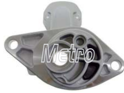
51-826005 DE Housing 12V, 3.0kw

For: Denso PLGR PA90 Starters Used: Replace: 428400-5121 Dim: OE: 428000-512, 428000-523, 428000-531 Lester: 19120, 19335, 19808 Note: Ref 190-9060, 190-9061, 190-9062 DE w/Ground Hole M12 x 1.75