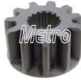
54-82556 Pinion Gear 11T, CCW, -16SPL

For: Denso PA90 Used: Replace: 028371-9210 Dim: 40mm Gear OD OE: 428000-603, 428000-690, 428000-710, 428000-711, 428000-712, 428000-714, 428000-787, 428000-992 Lester: 16020, 19334, 19856, 30483, Note: 33321