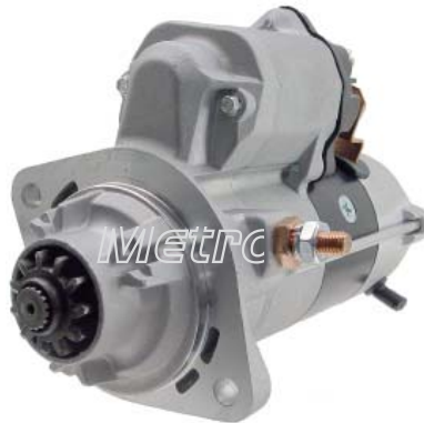
19335N Starter 12V, 2.7kw, CW, 11T Battery Post M10

For: Bluebird, Capacity, Ottawa Replace: Application: 2007 Bluebird, Capacity & Ottawa Applications with Cummins ISB Engines Dim: Lester: 19120 OE: 428000-512 Ref: 190-9060 Note: Can replace to 16990 (Denso OSGR).