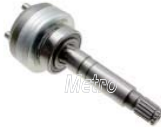
54-82030 Clutch Assy CCW

For: Denso PLGR PA90 Starters Used: Replace: Dim: OE: 428000-7110, 428000-9940 Lester: 30483 Note: Gear use 54-82555