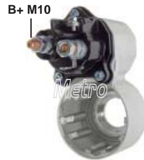
66-82673 Solenoid Assy 12V, 3.0kw, 3-Terminals

For: Denso PLGR PA90 Starters Used: Replace: Dim: Batt. Term M10 x 1.50 Motor Term M10 x 1.50 Switch Term Spade OE: 428000-523 Lester: 19808 Note: Use w/Lower Stationary Gear