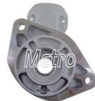
51-826009 DE Housing

For: Denso PLGR PA90 Starters Used: Replace: Dim: OE: 428000-462 Lester: Note: